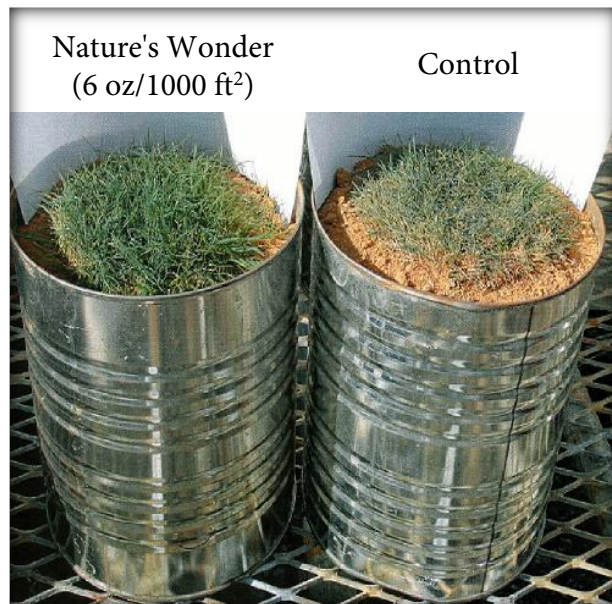
Above: Plugs mowed to 3/8" and pulled, soil & roots cut to thatch layer, let acclimate for 2 weeks. Plugs were then placed in the sun for 3½ weeks without irrigation.