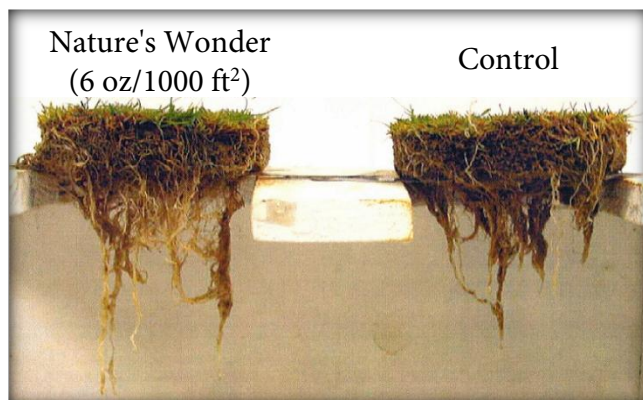
Left: Plugs mowed to 3/8" and pulled, soil & roots cut to thatch layer, let acclimate for 2 weeks. Then placed in the sun for 3½ weeks without irrigation. The presence of white roots demonstrates the continued growth during the 3½ week drought period.